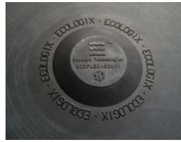
Performance membrane, made in U.S.A.