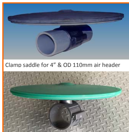
Clamp saddle for 4" & OD 110mm air header