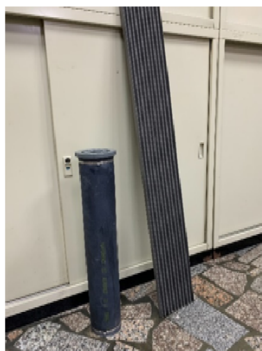
left: Air diffuser ; Right: Insert track