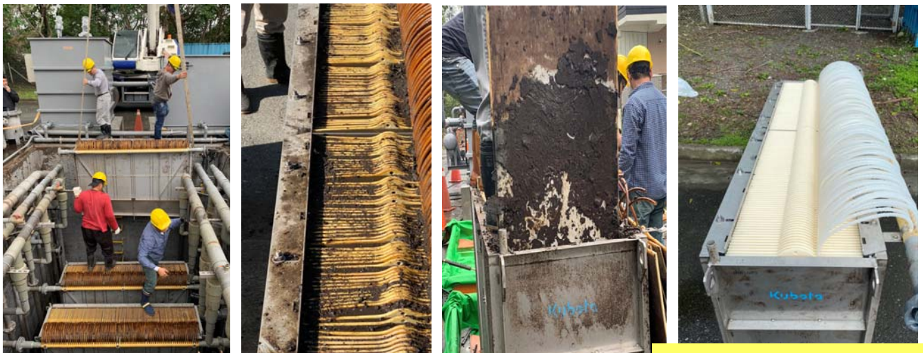
Ecologix PVDF element inserted into Kubota cassette

Photos: In Taiwan, if client buy Ecologix element to replace Kubota element, upon client's request, our engineer will go to job site to instruct the client to lift out the Kubota module, disassemble and discard the Kubota element, then insert Ecologix element. Also instruct client how to repair the Kubota air diffuser.